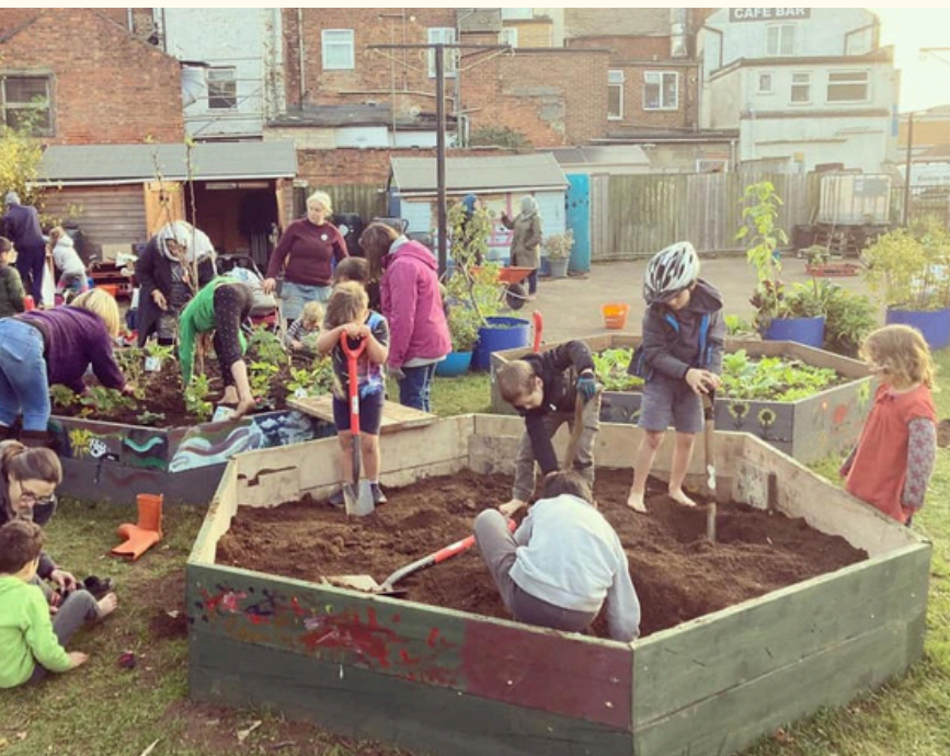
Picture: Bridge Street Community Garden, Banbury